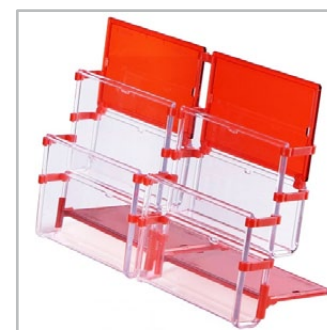
Displays, A-boards and doorplates