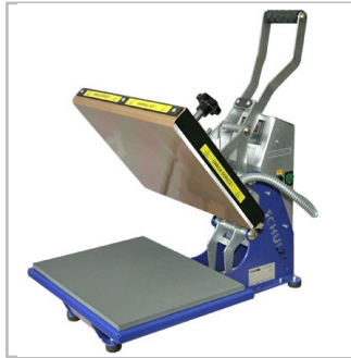
Heat transfer presses