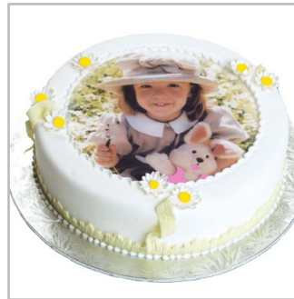
Edible inks and paper