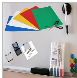
Magnets and magnetic accessories