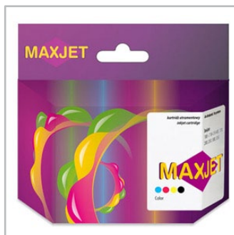
cartridges and inks for printers