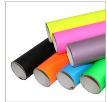
Flex and flock films