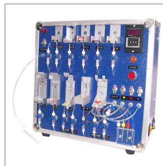
devices for regeneration