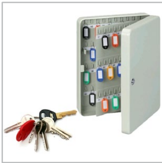
Secure Keys Cabinets