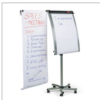
Flipcharts and accessories