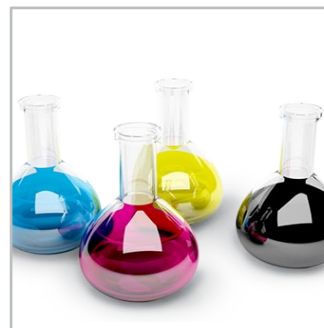
OCP brand dedicated inks