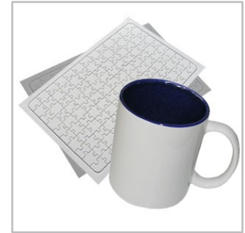
Mugs, puzzles, metals and others