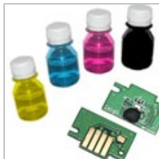
inks and chips for plotters