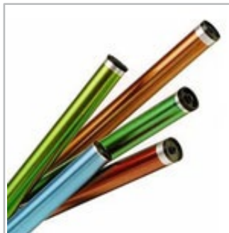
components for regeneration