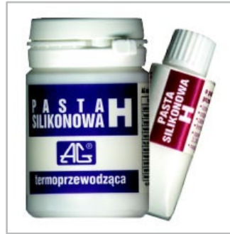
Electronics for chemistry