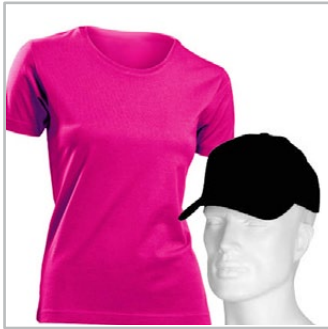
T-shirts and other textiles