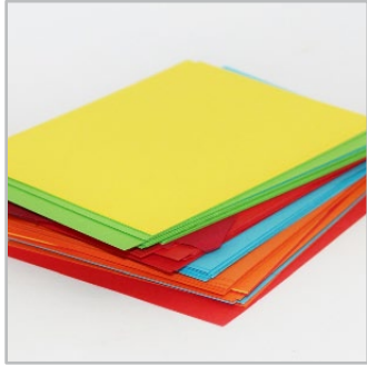
Paper for printers