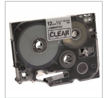
Tapes for printers and fax machines