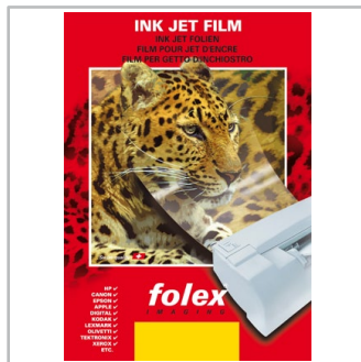
Foils for printers